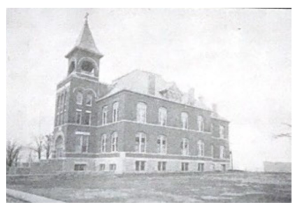
The third church, located at 26th and Oak streets

process of moving the belongings of both church and school from the old location to the new was begun on June 13, the feast of St. Anthony, and was completed June 20th, the feast of St. Aloysius on which day the first Holy Mass was celebrated in the sacristy