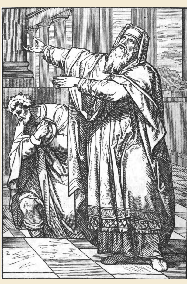
The Publican and the Pharisee

Please pray for good weather during this time of repair.